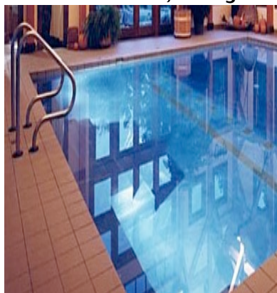
Wireless High Speed In Fitness Center Indoor Pool is open till 11 p.m.

Conference Cost Breakdown: 15 guest rooms for 1 night @ $69. ea +13% ($135.) Tax = $1,169.55