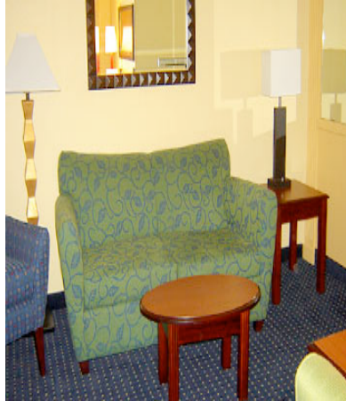
Conference Meeting Room Double Occupancy Bedroom Each Suites, Living Room